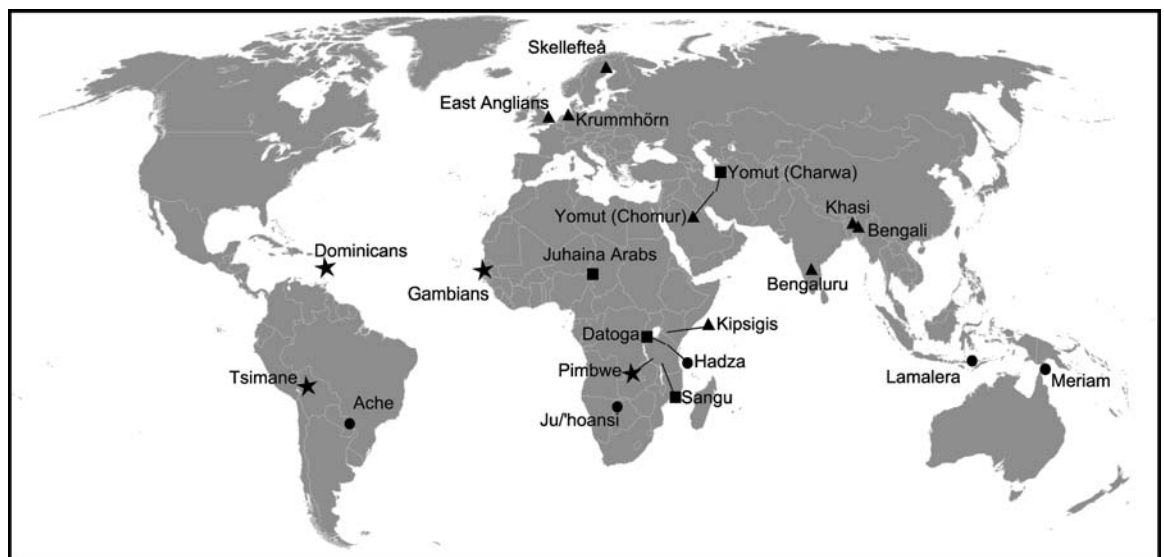
Fig. 1. Populations studied. Note: Circle indicates hunter-gatherers; star, horticulturalists; square, pastoralists; and triangle, agriculturalists.

Ideally, one would have comparable measures of the relative importance ( \alpha ) and degree of transmission ( \beta ) of each class of wealth, the degree of inequality in the distribution of each kind of wealth (Gini), and the extent of wealth shocks ( \sigma_\lambda^2 ). Measuring the last-mentioned is difficult in any economy and impossible in the economies under study, as the estimate requires long time-